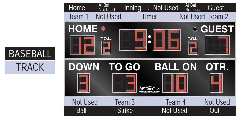
Figure 4. Secondary Programs Sign Configurations