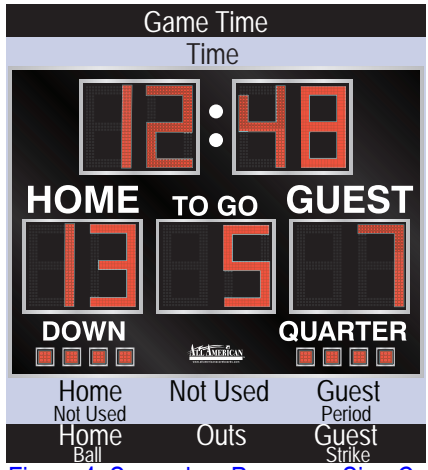
Figure 4. Secondary Programs Sign Configurations