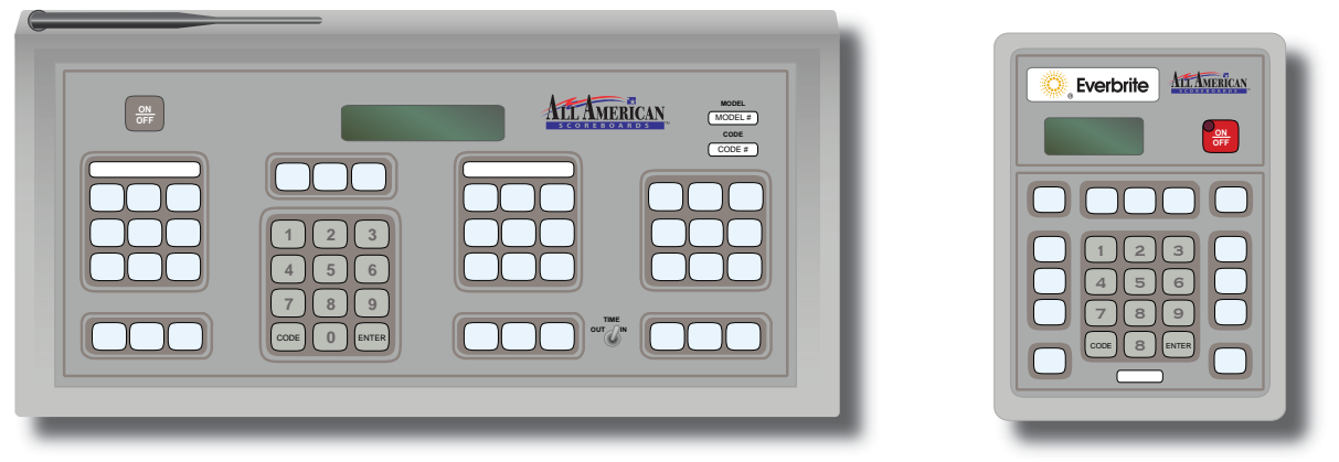
Figure 1A. 5000 Console (Radio)

CAUTION: To protect the control from damage, it is advisable to disconnect the control and store in a dry secure area when not in use.